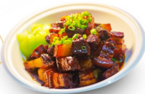
Stewed Donghai Pork with Brown Sauce