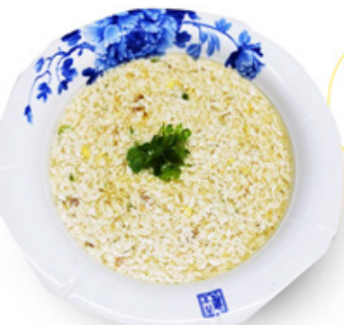
Pingqiao Bean Curd